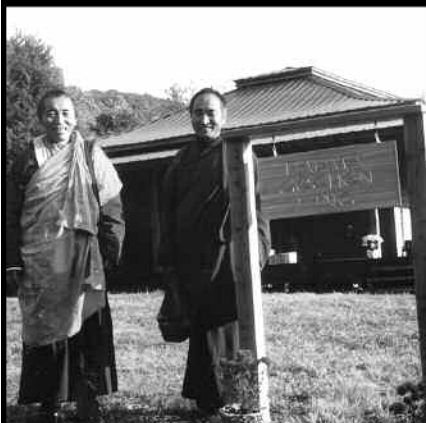
Padma Gochen Ling, PBC-TN retreat center

We are fortunate to have as our teachers two brother Lamas who are of the last generation of Tibetan Buddhist masters that were born and raised in Tibet before the Chinese invasion. Renowned as Dzogchen masters in the Nyingma lineage of Tibetan Buddhism, they are the founders and spiritual directors of Padmasambhava Buddhist Center, with groups in the U.S., Puerto Rico, Russia and India, and a beautiful monastery in upstate New York. They established the Tennessee sangha in 1987 and visit each year to give teachings at our retreat center, Padma Gochen Ling. To learn more about the Khenpos, visit their website, www.padmasambhava.org .